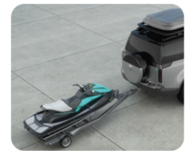
Rear Towing Bar