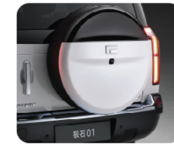
Full Size External Spare Tire (Including Spare Tire Cover)