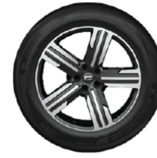
21" Double Color Wheel Rim with Four-season Tire (275/45 R21)