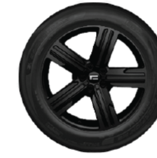
21" High Brightness Black Wheel Rim with Four-season Tire (275/45 R21)